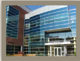
The newly renovated Klau Library at HUC

Over the past two years, HUC-JIR has invited the SCRJ to meet with students at the Cincinnati and New York campuses and to participate in the annual Senior Seminar with rabbinical and cantorial students completing their studies and approaching Ordination/Investiture. This past year, the SCRJ initiated its scholarship program in Cincinnati through awards to five students for their reflective essays on their understandings and connection to Classical Reform Judaism.