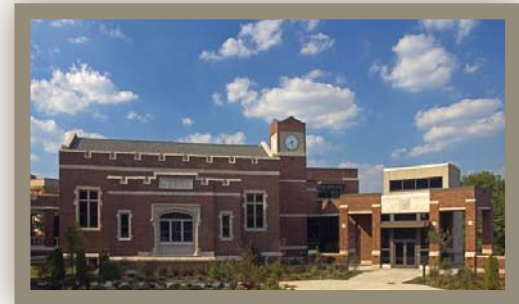
The Marcus Center of the American Jewish Archives on the HUC Campus

What is important is that we are constantly reminded to make these prophetic ideas into more than just thoughts or tenants of faith, but into actions. Hopefully, in this way, we can actualize the belief of the early Reformers that, “Reform Judaism had a universal message to proclaim and share: a message of faith through reason, compatible and not in conflict with science and modern culture... a broad, humanistic faith, whose definition of salvation was the moral and ethical transformation of society here on earth”.